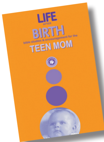
Life After Birth: Bible Study for teen moms

TastyFaith can help you connect the hope of Christ to church-ed and non-church-ed youth.